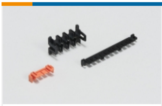
Rectangular Connector Locking(14)